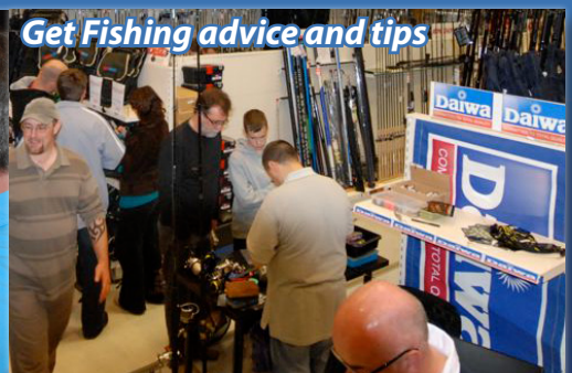
Get Fishing advice and tips