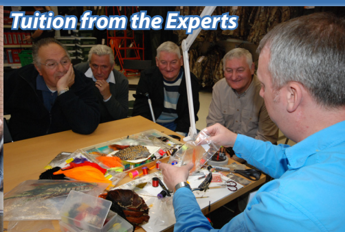
Tuition from the Experts