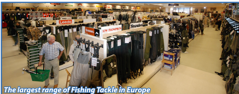
The largest range of Fishing Tackle in Europe

There are more than 1,500 rods right across the angling spectrum, all set up and on display, and you are most welcome to get them out of their racks and try them out in our 30 meter casting pool OR try