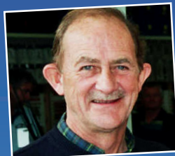
PAUL YOUNG FILM STAR